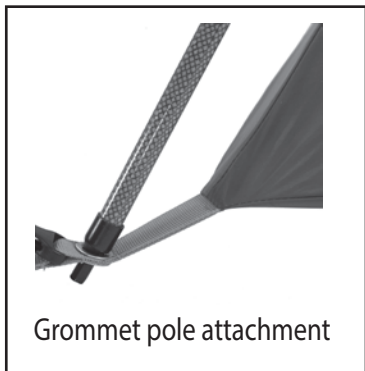
Grommet pole attachment

Insert pole tip into grommets at back stake loop corners, flex pole to stand up tent, insert pole tip into grommets on front stake loops. Be sure to lift tent body of 6 person as well as pole. 2 and 4 person, attach center clip at crossing point of poles.