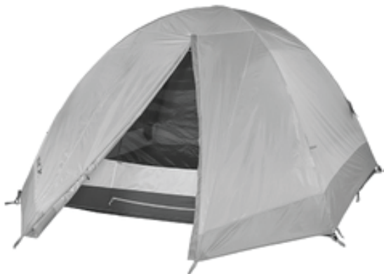
Outback 4 pictured

In order to familiarize yourself with your new tent, we recommend you "test pitch" before your first camping trip. For additional information please visit www.kelty.com .