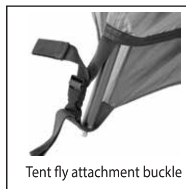
Tent fly attachment buckle