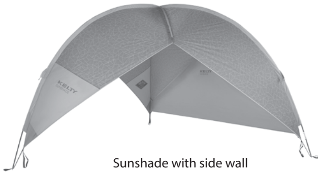
Sunshade with side wall

In order to familiarize yourself with your new tent, we recommend you "test pitch" before your first camping trip. For additional information about Kelty products please visit Kelty.com .